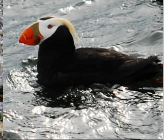
Marine wildlife watch